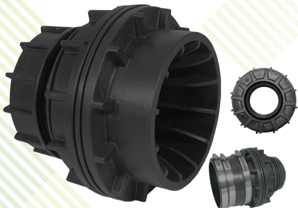
Ducted Entry Boot